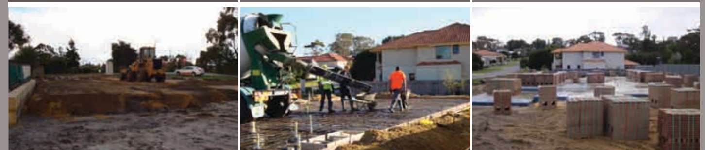
Pre Construction Construction