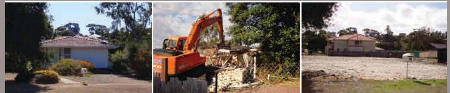
Before Demolition Pre Construction