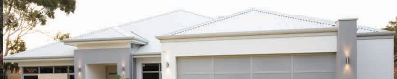
The construction process